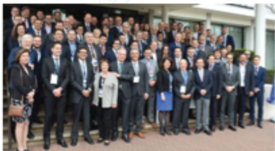
A record number of M&A Worldwide members and guests attended last meetings

Luxembourg Lithuania Malaysia Mexico Morocco Netherlands Norway Poland Portugal Romania Saudi Arabia Singapore South Africa Spain Sweden Switzerland Thailand Tunisia Turkey Ukraine USA Vietnam